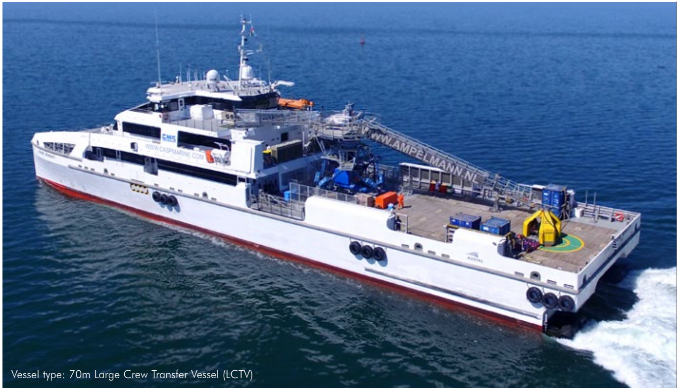
Vessel type: 70m Large Crew Transfer Vessel (LCTV)